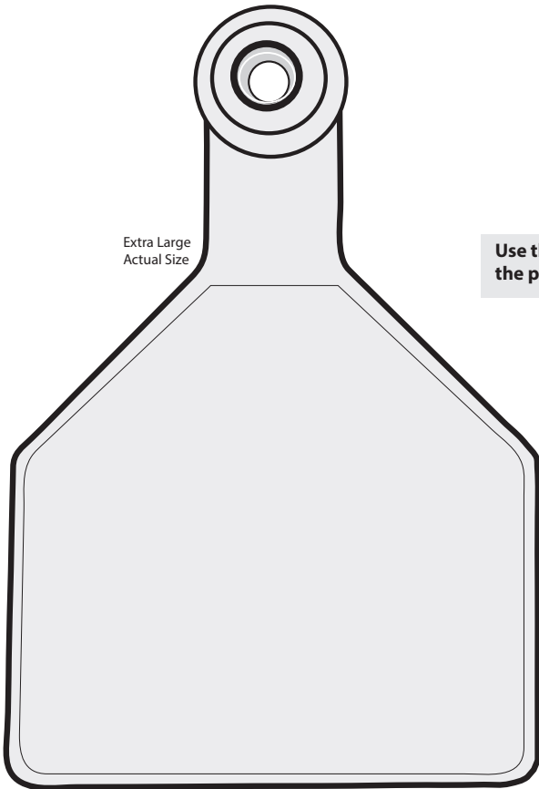
Extra Large Actual Size

Use the images to illustrate how you want the printing on your tags